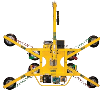
Low-Profile Manual Rotator/Tilter 1100 (DC) w/ Intelli-Grip™ .....MRTALP811LDC3