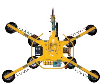
Quadra-Tilt™ Rotator 1400 (DC) w/ Intelli-Grip™ ..... MRTA811LDC3