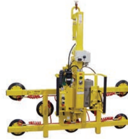
Manual Rotator/Power Tilter (AC) 1000 (AC) .....MRPT89AC