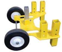
MRT Dolly ..... 98790