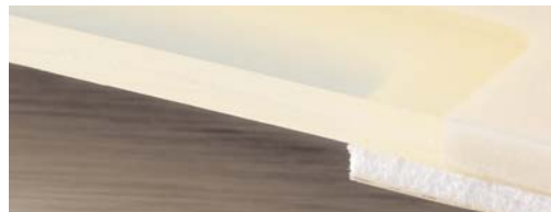
Integrated Window bonds window material to IC1000™ Pad.